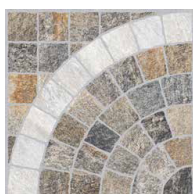
Multi-Colour White Arch 03