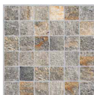
Multi-Colour Linear 03