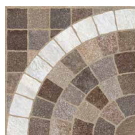
Natural White Arch 04

Please Note: Tones in these images are indicative. Real samples can be requested for free.