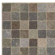
Natural Linear 04