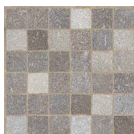
Grey Linear 02